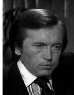
David Frost A British TV Presenter